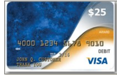
Company Branded Reward Cards